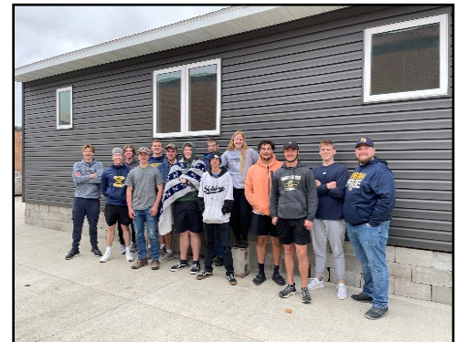
Spartan Build Team - North High School